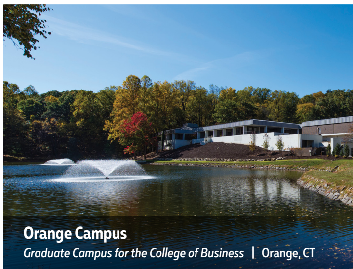
Orange Campus Graduate Campus for the College of Business | Orange, CT

The Metropolitan Nashville Police Department responded with no reportable crimes at this location for reporting years 2018, 2019, or 2020.