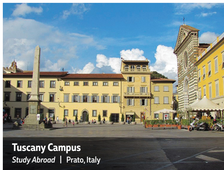
Tuscany Campus Study Abroad | Prato, Italy

New London Police Department responded with no Clery reportable crimes at this location for reporting years 2018, 2019, or 2020.